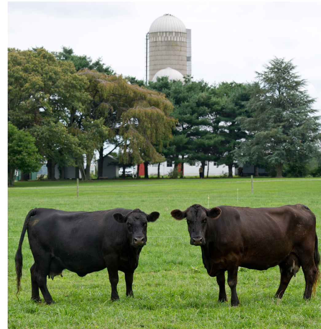
Beef farm in Kennedyville, Maryland.