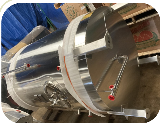
The recently delivered 500-gallon tank