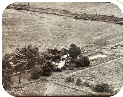
Aerial view of the future cidery location.