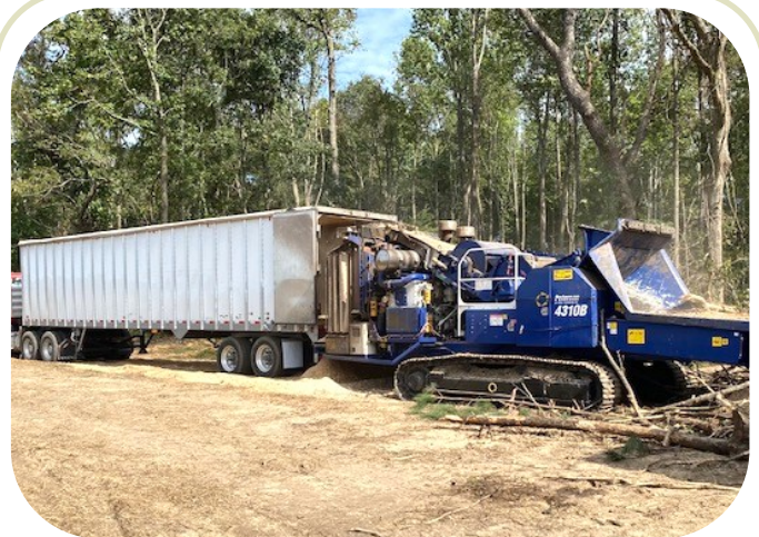
The micro-chipper purchased with the Relief Grant.