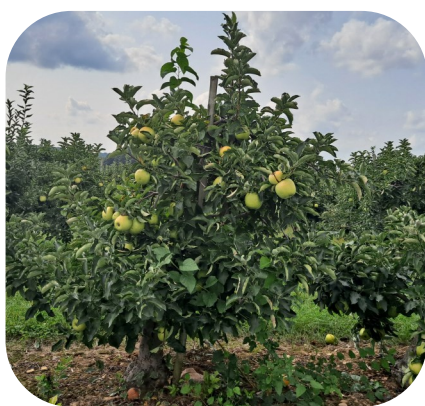
Apple tree at Milburn Orchards Inc.