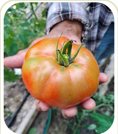
A freshly picked primo tomato.